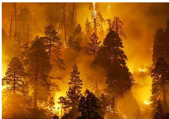
The Fire of Jeremiah

God promises a judgement by fire in the End Times. “And I will send a fire on Magog, and among them that dwell carelessly in the isles: and they shall know that I am the LORD ” Ezekiel 39:6.